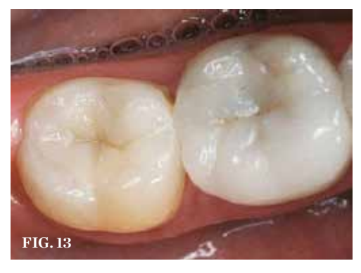
(11.) Two 15-year-old semi-direct biomimetic restorations. (12.) A 10-year-old stress-reduced direct composite restoration that included fiber placement for stress relief. (13.) These Empress inlay and Empress onlay restorations are 17 years old. Replacing occlusal and interproximal enamel, they are bonded to stress reduced bio-bases consisting of immediate dentin sealing, resin coating, and dentin replacement.

than 30 MPa. This deep margin elevation, in conjunction with immediate dentin sealing, resin coating, and the composite "dentin replacement," is referred to as the "bio-base" a term used by the Academy of Biomimetic Dentistry for the stress-reduced, highly bonded foundation that the indirect or semi-direct inlay or onlay will be bonded to.50,51