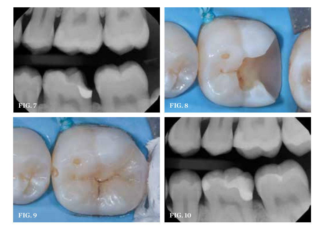
(7.) Completed margin elevation with perfect marginal seal. Mesial caries treated separately at cementation appointment. For an indirect restoration, the final impression will be taken now. (8.) Cementation appointment. Tooth is conditioned by air abrasion and phosphoric acid etching for maximum bond strength. An indirect or a chairside fabricated Inlay restoration provides maximum stress reduction and maximum bond strength. (9.) Cementation of inlay, access of mesial caries. Mesial lesion is restored separately to conserve valuable intact tooth structure. (10.) Final radiograph.